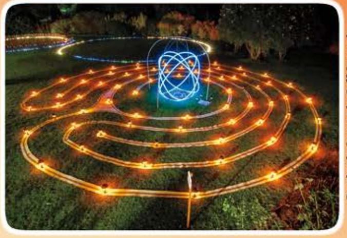
Portland, Oregon

An international organization whose mission is to support all those who create, maintain and use labyrinths, and to serve the global community by providing education, networking and opportunities to experience transformation.