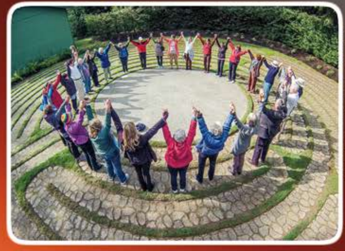
Vancouver Island, Canada by Lars Howlett