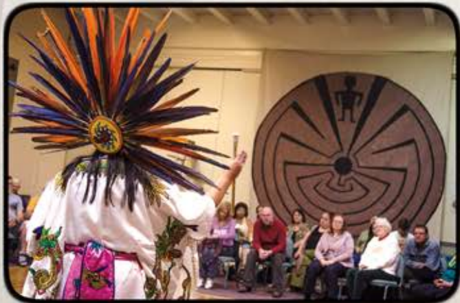
Taos, New Mexico

Would you like to connect locally with TLS members and labyrinth enthusiasts? If so, a Regional Rep can help you find nearby groups, events and projects. A list of Regional Reps is provided on our website.